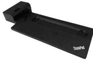
ThinkPad® Pro Docking Station