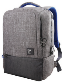
Lenovo On Trend Backpack