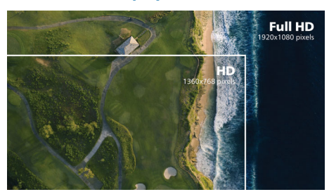
Picture quality matters. Regular displays deliver quality, but you expect more. This display features enhanced Full HD 1920 x 1080 resolution. With Full HD for crisp detail paired

with high brightness, incredible contrast and realistic colours, expect a true-to-life picture.