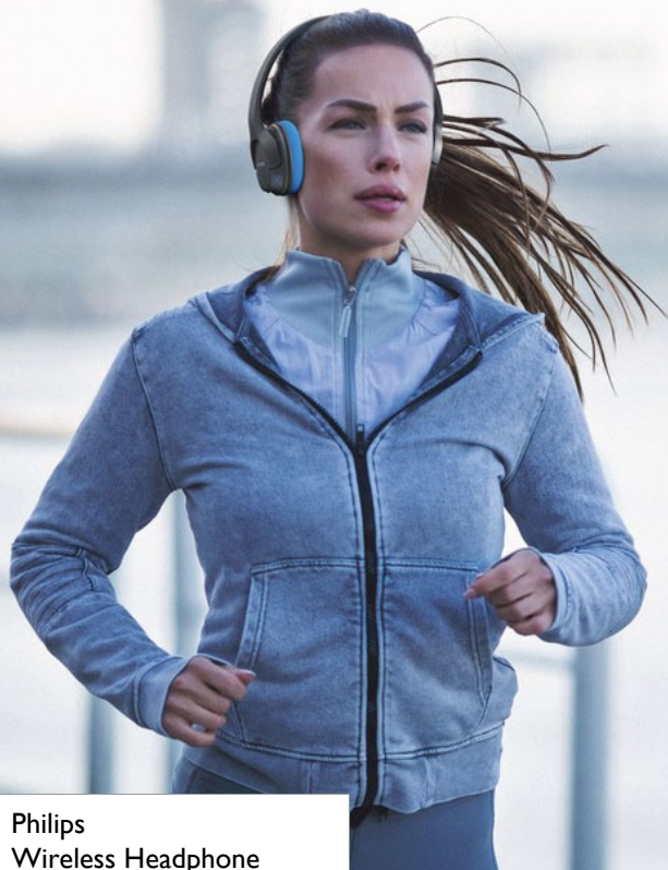
Philips Wireless Headphone