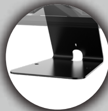
Sturdy Base Mount Drilled & Non-Drilled Options

Durability finally stops getting in the way of convenience with the Display Stand for CTA Digital Kickstand Magnetic Cases. The perfect partner to your protective case, this display stand works hand-in-hand to add versatility to your office, point of sale, classroom or even your home. This ingenious stand lets the rotary on the back of the case work perfectly allowing 360-degree rotations. It supports your tablet on any desk or table, allowing you to use a Bluetooth keyboard like a laptop or to simply enjoy some streaming videos.