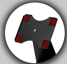
Magnetic Base Connection to MSPC10 Case