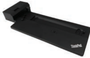
ThinkPad® Pro Docking Station