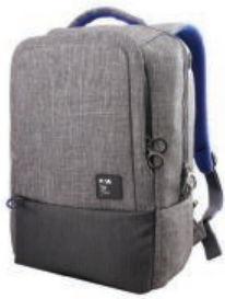
Lenovo On Trend Backpack