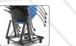
DL1 STACKING DOLLY STACKS 10 CHAIRS (4 LEGS ONLY)