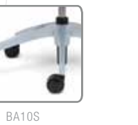
BA10S 26" HIGH PROFILE ALUMINUM BASE SILVER POWDER COAT