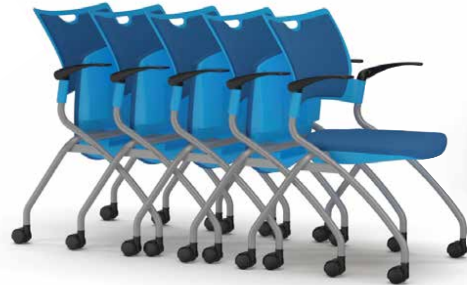
Front Cover: 1310-GT-A12-SF-US-P18; Maraham Messenger Satsuma Top: 1315-GT-A12-SF-UP-P20; Momentum Core Electric Blue Bottom: 1320-GT-A12-SF-UP-P20; Momentum Core Electric Blue

4 leg models stack four high on the floor and ten high on optional cart. Ganging brackets available.