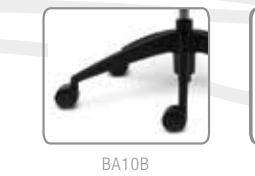
BA10B 26" HIGH PROFILE ALUMINUM BASE BLACK POWDER COAT