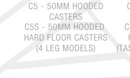
C5 - 50MM HOODED CASTERS C6 - 60MM HOODLESS CASTERS C5S - 50MM HOODED HARD FLOOR CASTERS (4 LEG MODELS) C6S - 60MM HOODLESS HARD FLOOR CASTERS (TASK MODELS AND STOOLS)