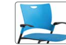
A12 FIXED ARM