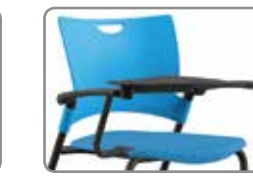
TAB-A14 RIGHT FOLDING TABLET ARM W/ A14 LEFT ARM