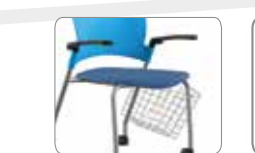
BSK LEFT OR RIGHT SIDE HANGING WIRE BASKET