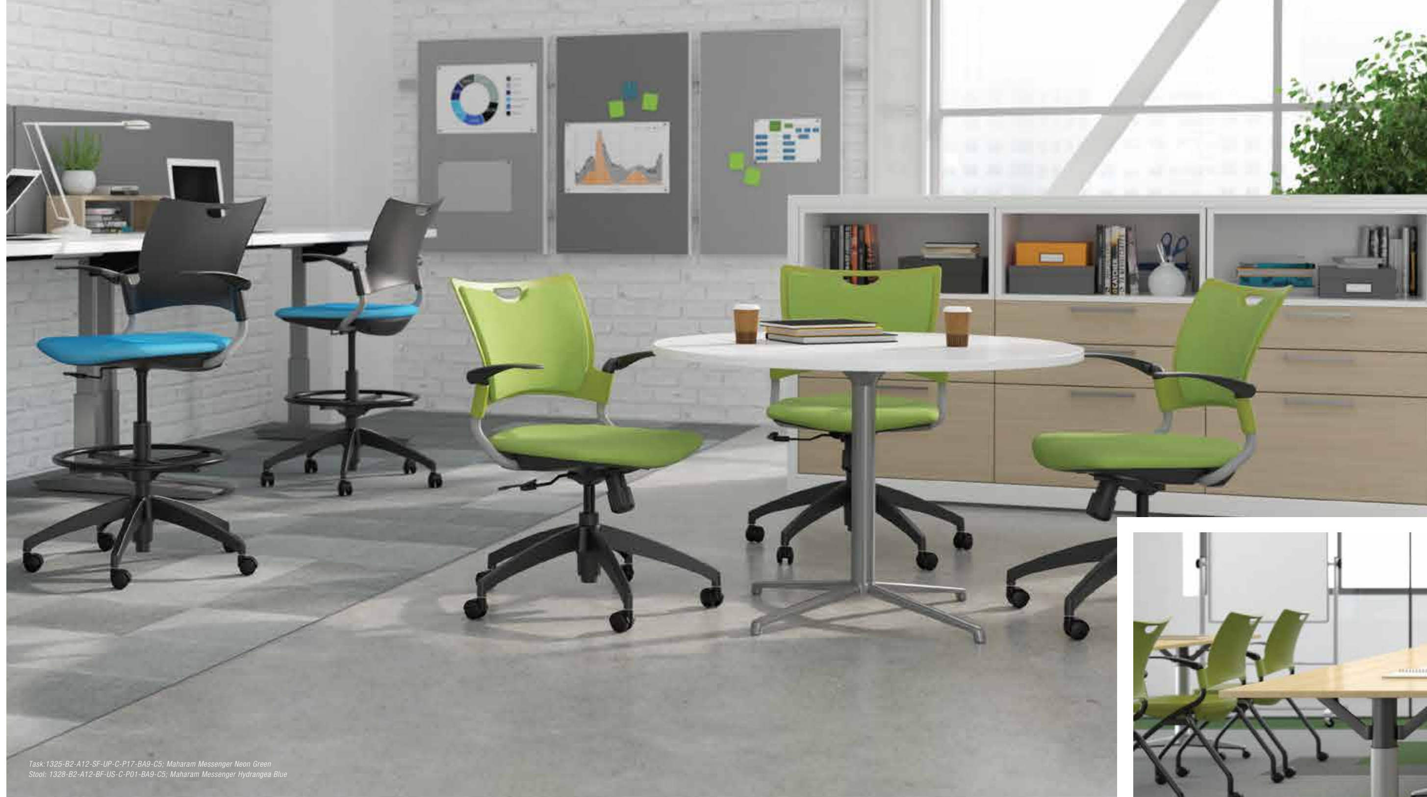
Task 1325-B2-A12-SF-UP-C-P17-B49-C5; Maharam Messenger Neon Green Stool: 1328-B2-A12-BF-US-C-P01-B49-C5; Maharam Messenger Hydrangea Blue