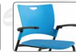
A14 REINFORCED EXTENDED FIXED ARM