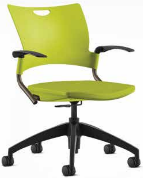
Main: 1310-GT-A00-GMF-AP-P20 Top: 1320-GT-A12-GMF-AP-P20-C5 Bottom: 1325-B2-A12-GMF-AP-P17-C5

Adapt. React. Move. People are on the move, looking for new and innovative ways to get stuff done. As a result, collaborative spaces are in high demand. The Bella multi-purpose series transforms any space into a dynamic environment, capable of supporting the many ways people work. From flexible training areas, to dedicated workstation spaces, to the countless gathering opportunities in between, the Bella collection possesses an impressive design that delivers comfort and flexibility.