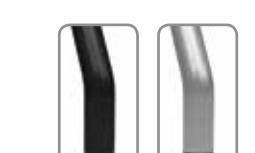
BF BLACK SF SILVER