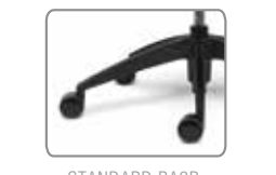
STANDARD BA9B 26" HIGH PROFILE NYLON BASE-BLACK