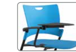
TAB-A00 RIGHT FOLDING TABLET ARM