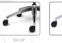
BA10P 26" HIGH PROFILE ALUMINUM BASE POLISHED