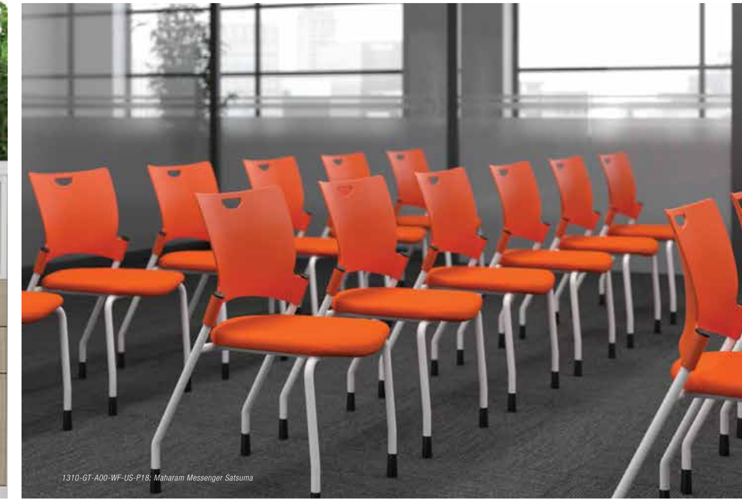
1310-GT-A00-WF-US-P18; Maharam Messenger Satsuma

Task models are ideal for collaborative spaces, meeting rooms and other workspace areas. Arm and armless models available. Or for higher working surfaces, the stool models are ideal.