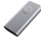
Dell Portable Thunderbolt™ 3 SSD, 500GB (SD1-T0500)