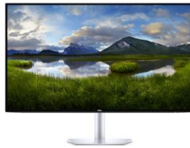
Dell 27 Monitor - S2719DC