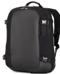
Dell Premier Backpack