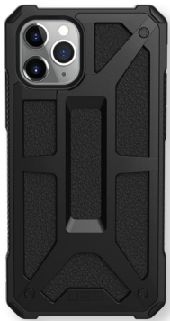
BLACK SKU // 11170114040 UPC // 812451032178