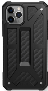
CARBON FIBER SKU // 11170114242 UPC // 812451032185