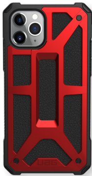
CRIMSON SKU // 11170119494 UPC // 812451032192