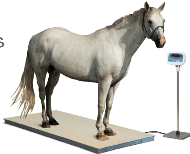
Shown with optional floor stand