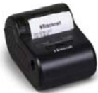
Shown with optional printer 816965005727