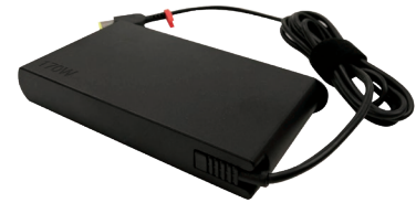
New Slim ThinkPad® 230W AC Adapter