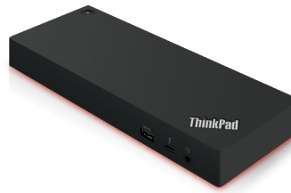
ThinkPad® Thunderbolt™ Workstation Dock