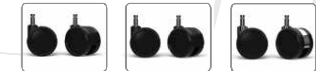
C6 60MM HOODLESS CASTERS C6S 60MM HOODLESS HARD FLOOR CASTERS C7 60MM HOODLESS CHROME ACCENTED CASTERS