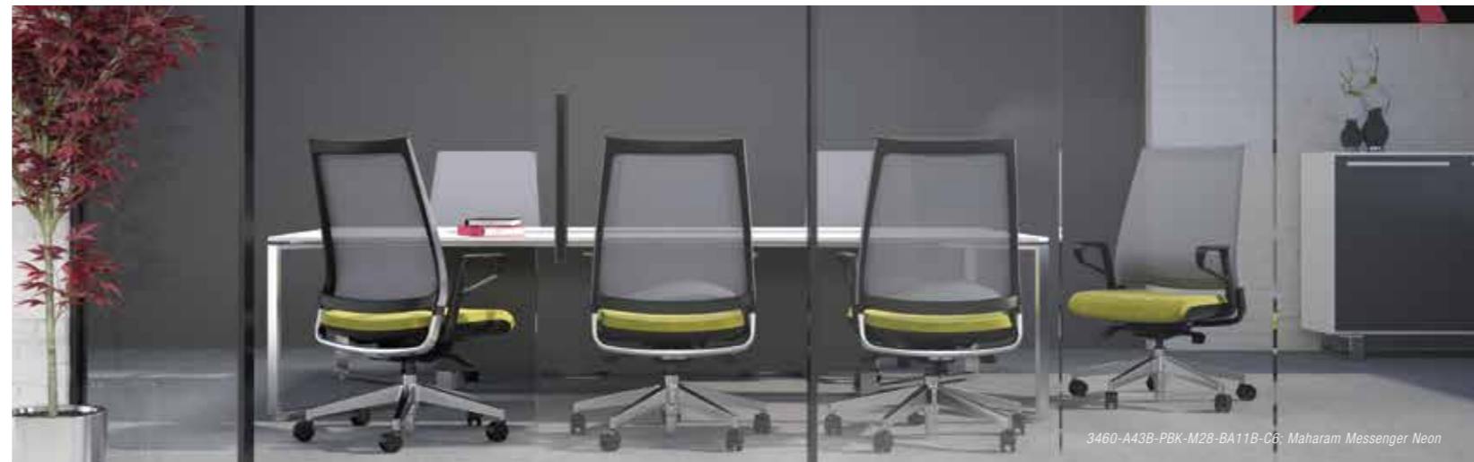
3460-A43B-PBK-M28-BA11B-C6; Maharam Messenger Neon