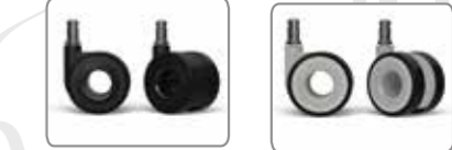
C22B 60MM BLACK HUBLESS CASTERS C22G 60MM GRAY HUBLESS CASTERS