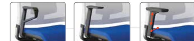
A42 NYLON LOOP ARM BLACK/GRAY A43 FIXED ARM-BLACK/GRAY A45 4-WAY HEIGHT ADJUSTABLE ARM-BLACK/GRAY