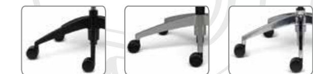
BA11B 27" MID PROFILE NYLON BASE-BLACK BA11G 27" MID PROFILE NYLON BASE-GRAY BA12P 27" MID PROFILE ALUMINUM BASE-POLISHED