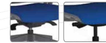
W1 WEIGHT BALANCED SYNCHRO W2 ADVANCED WEIGHT BALANCED SYNCHRO