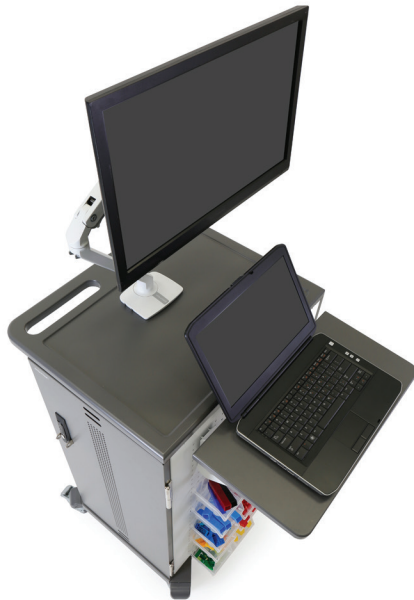
98-381-F56 YES24/36 PEGBOARD SHELF