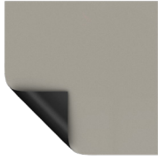
High Contrast Da-Mat