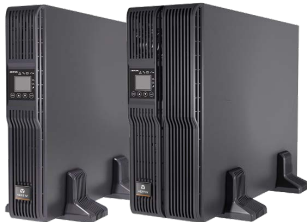
ENERGY STAR® qualified UPS models