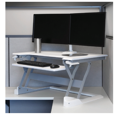
SHOWN WITH WORKFIT-TL SIT-STAND WORKSTATION

FACH MONITOR HAS INDIVIDUAL UP/DOWN TILT