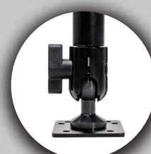
Ball Socket Joints