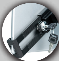
Lock + Key