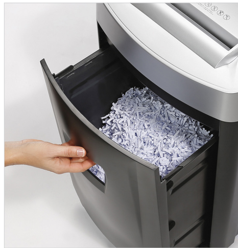
The 9 gallon waste bin features a clear window to view shred level and is easy to empty.