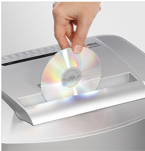
Powerful, compact shredder also shreds CDs and DVDs for added data security.

Quiet and hassle-free, this desktop shredder is ideal for destroying financial statements, tax information, and other confidential documents.