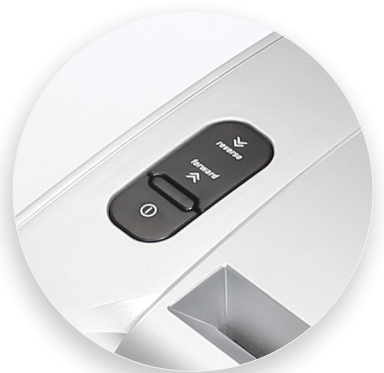
Convenient, easy-to-use controls for simple operation.