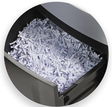
Security Level P-4 for the destruction of confidential documents.

The Dahle PaperSAFE® 22318 Deskside Shredder is oil-free, hassle-free, and easy to maintain. It features whisper quiet operation, automatic jam protection, and a thermally protected motor to prevent overheating. This P-4 shredder produces a \frac{3}{16} " x 1\frac{1}{16} " particle size and holds up to 9 gallons of shredded waste. It's ideal for destroying financial statements, tax information, or any other confidential documents that should not be seen by others.