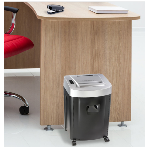
Compact size makes it easy to place the shredder wherever you need it most.