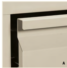
A. Recessed angled full pull

All cabinets have a recessed angled full pull design and removable lock core.