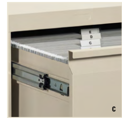
C. Front-to-back filing