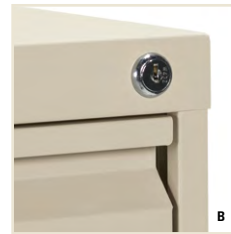
B. Removable core lock