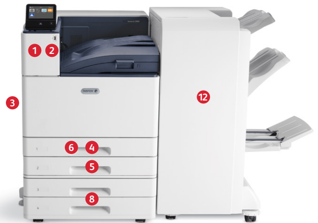
Xerox® VersaLink® C9000 Color Printer Print. Mobile connectivity.

1 Card Reader Bay and internal card reader compartment.