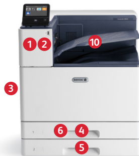
Xerox® VersaLink® C8000 and C9000 Default Configuration