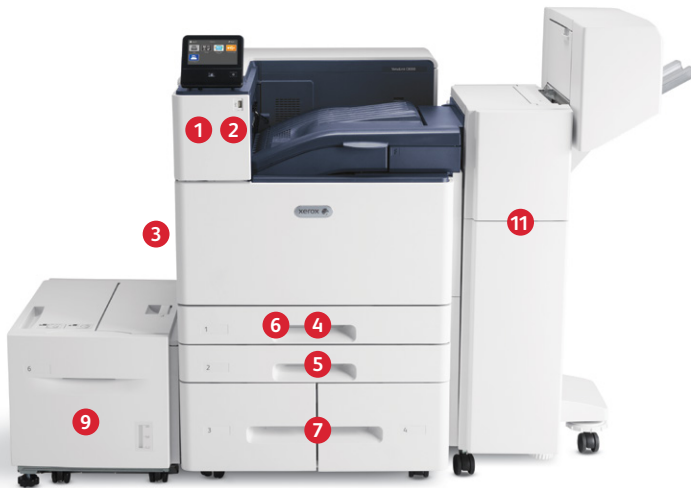
Xerox® VersaLink® C8000 Color Printer Print. Mobile connectivity.