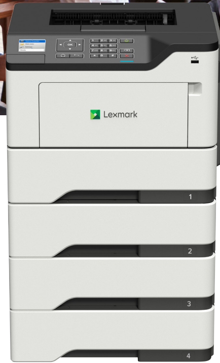
B2650dw with optional trays