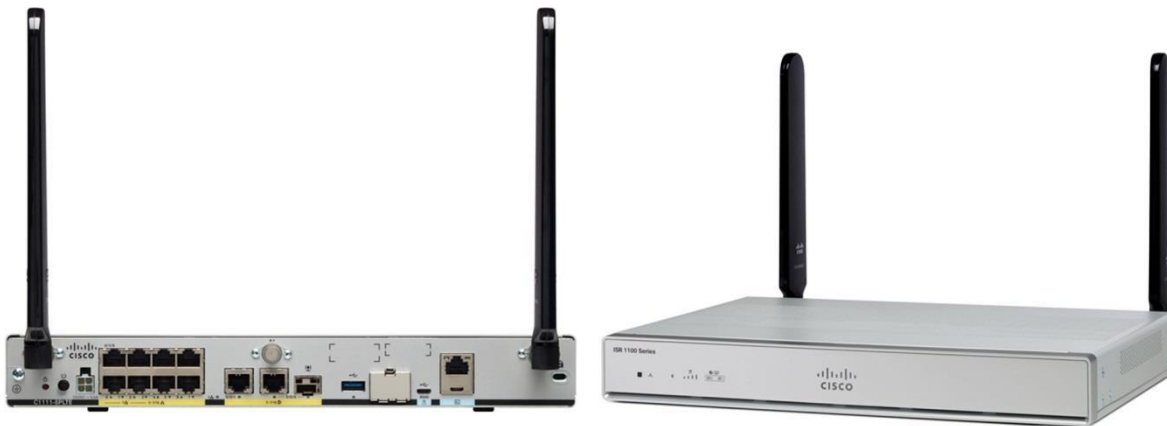
Figure 2. Cisco 1100-8P ISR with LTE Advanced, Back and Front View