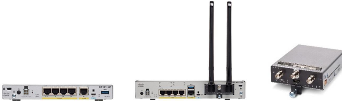
Figure 4. Cisco 1101-4P and 1101-4PLTEP with LTE Advanced Pluggable