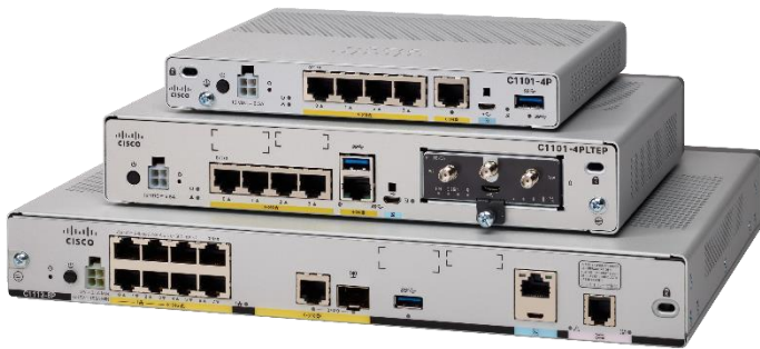
Figure 1. Cisco 1100 Product Family Series

Note: Not all 1100 series SKU variants are available in every region with different technologies (check on CCW pricelist for your region).