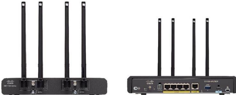
Figure 6. Cisco 1109-4PLTE2P with dual LTE pluggable and 802.11ac Wi-Fi options (Available late January, 2019)