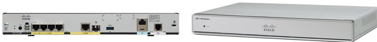
Figure 3. Cisco 1100-4P ISR with DSL, Back and Front View