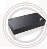
ThinkPad Thunderbolt 3 Dock