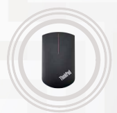
ThinkPad Precision Wireless Mouse