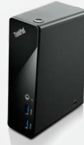
ThinkPad USB 3.0 Dock (0A33970)