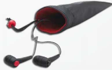
ThinkPad In-Ear Headphones with microphone (57Y4488)