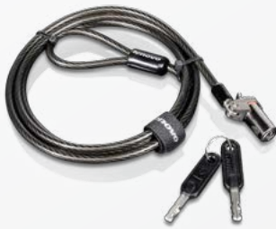
Kensington Microsaver DS Cable Lock (0B47388)