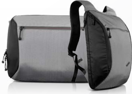
ThinkPad® Ultralight™ Backpack (0B47306) and Topload (0B47307)

Whether it is improving usability or enhancing performance, these specially designed Lenovo accessories will make your PC experience better.