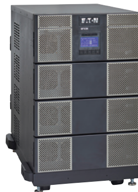
8-slot cabinet is scalable to 16 kVA in a 14U cabinet