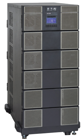
12-slot cabinet is scalable to 20 kVA (N + 1) in a 21U cabinet