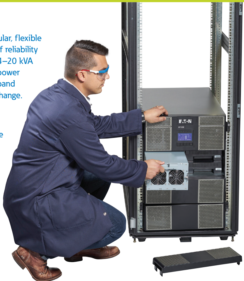
Easy hot-swappable power and battery modules

The plug-and-play power and battery modules are user replaceable so you can add them as needed without a service call or having to put a redundant system in bypass. With its low initial investment, online double-conversion technology, Eaton ABM® technology and high efficiency mode, you never have to compromise reliability for efficiency.