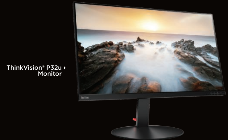
ThinkVision ® P32u ▶ Monitor