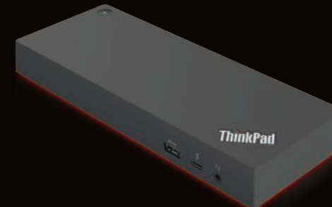
◀ ThinkPad ® Thunderbolt ™ Workstation Dock