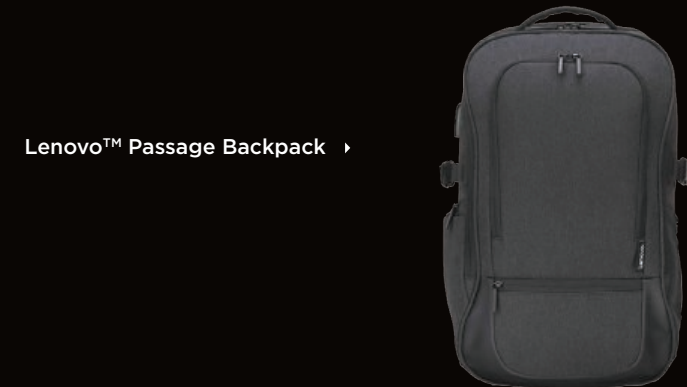
Lenovo ™ Passage Backpack ▶