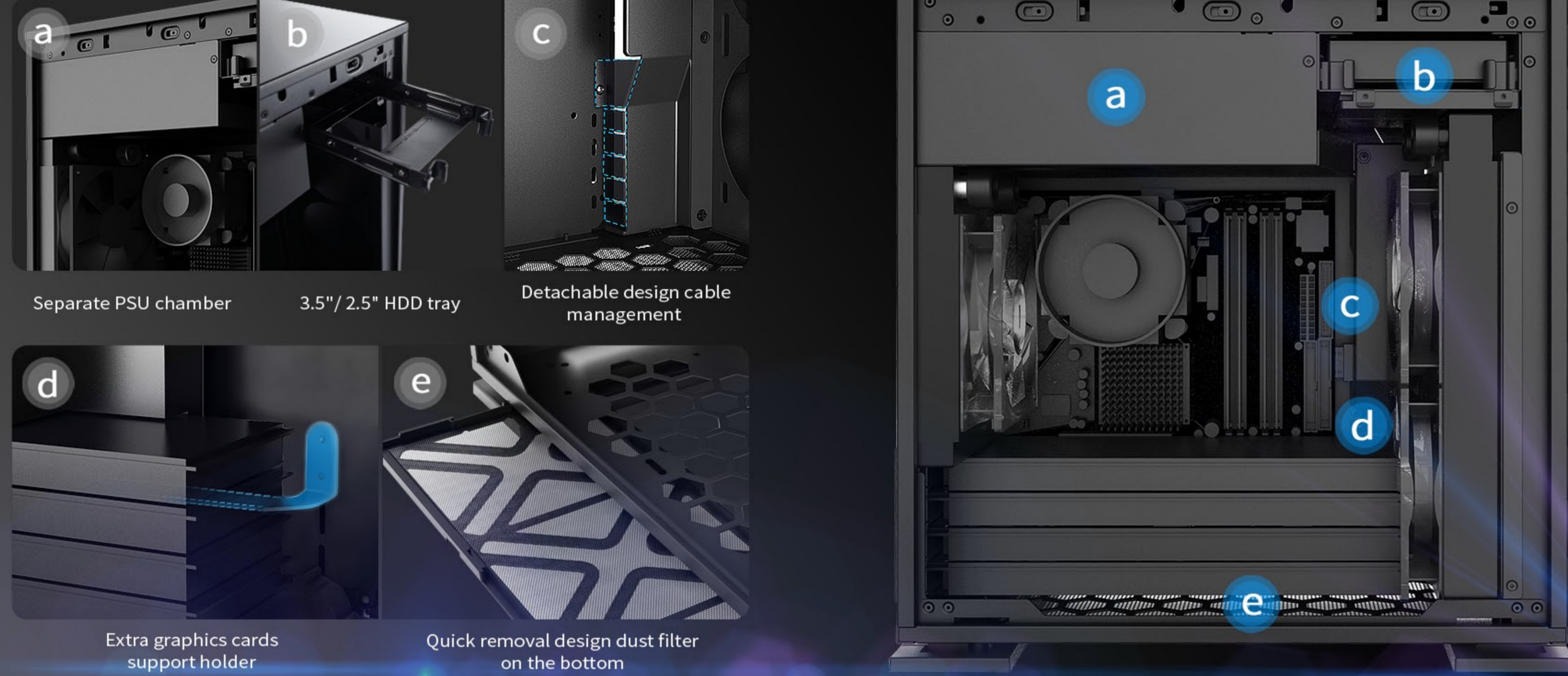
a Separate PSU chamber