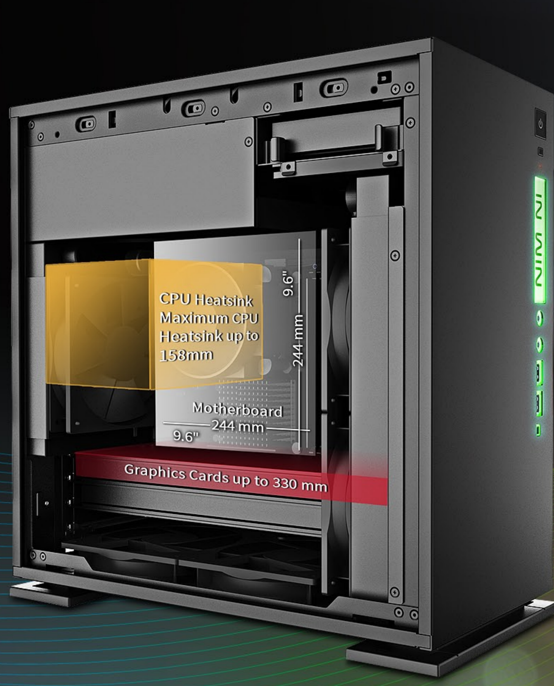
CPU Heatsink Maximum CPU Heatsink up to 158mm