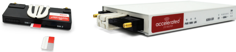
DUAL-SIM SUPPORT WITH UPGRADABLE LTE CELLULAR MODEM

Being connected is everything in today's data-driven economy. Eliminating downtime is essential to maximize productivity, support critical business applications, and avoid outages or disruptions that can impact sales, customer service, brand reputation and compliance.