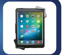
Holds Thick Cases