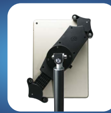
Adjustable Tablet Holder