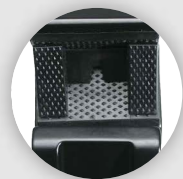
Anti-Slip Rubber Grips