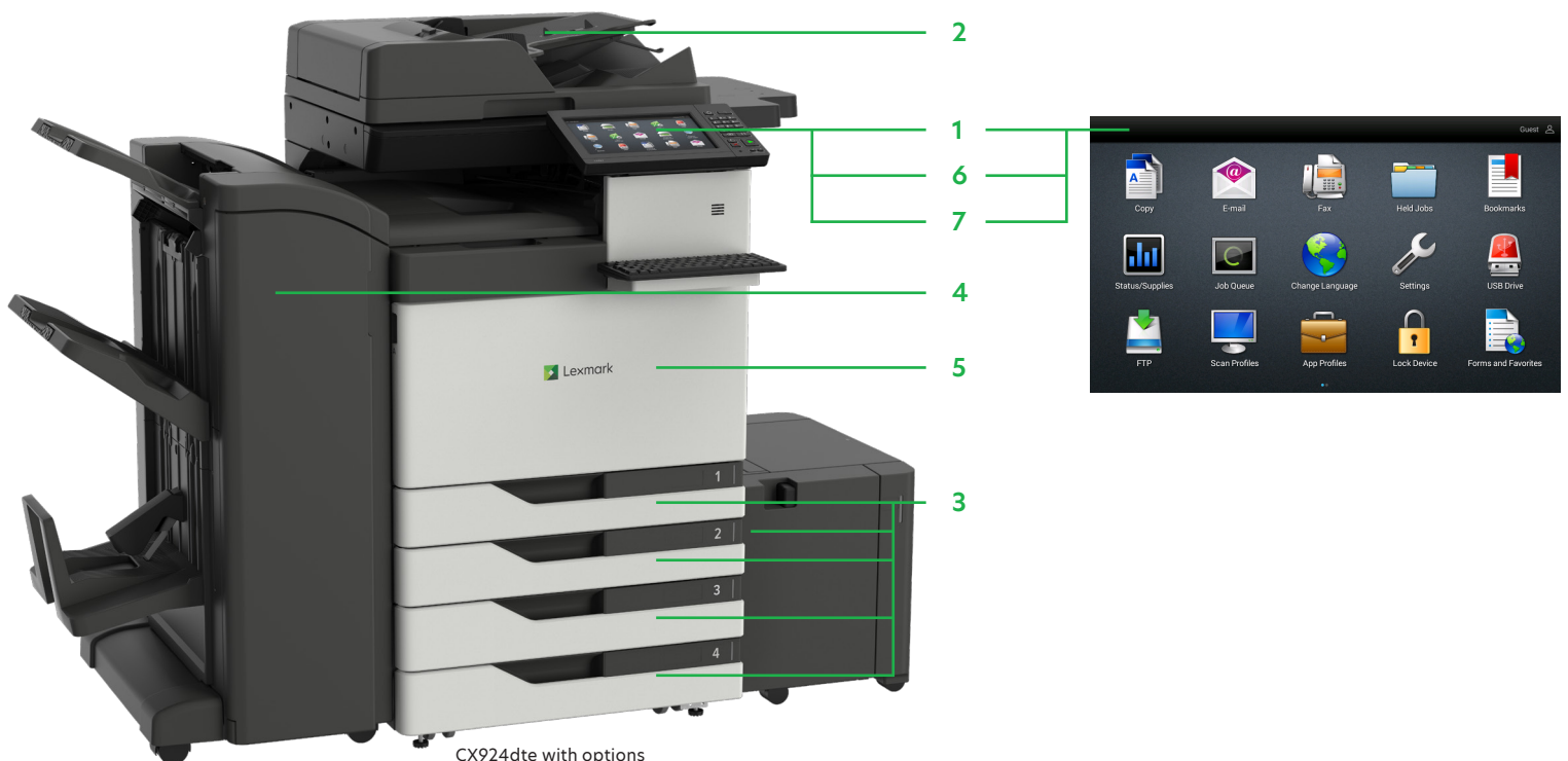
CX924dte with options

Print Microsoft Office files, PDFs and other document and image types from flash drives, or select and print documents from network servers or online drives.