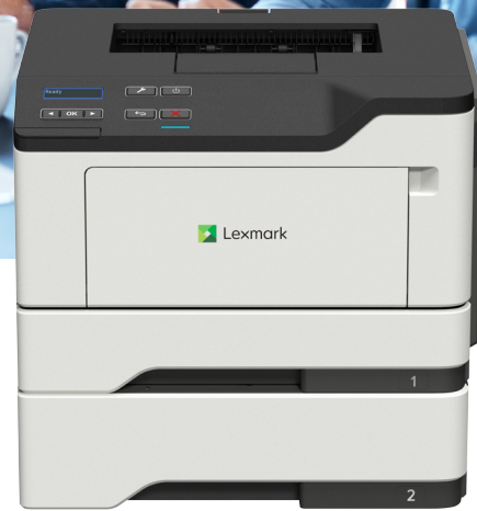
MS421dn with optional tray