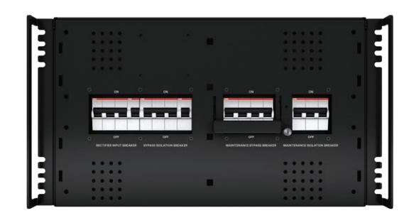
Front view (panel off) offers easy access to breakers

Utilize the optimized maintenance bypass option to enhance availability and keep your critical systems running during routine service or replacement. A maintenance bypass interlock ensures proper bypass operation.