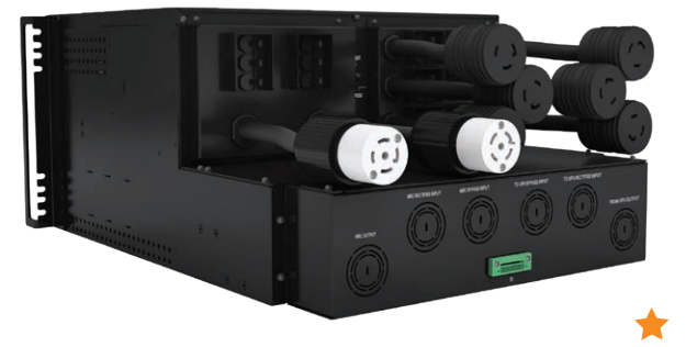
Rear view with I/O connections and Power Output Distribution options (hardwire and/or PODs)