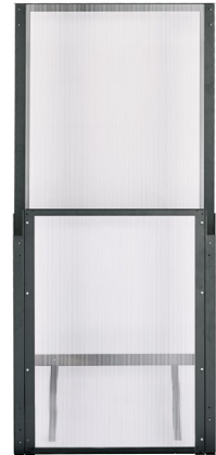
Net-Contain™ Height Adjustable Vertical Wall