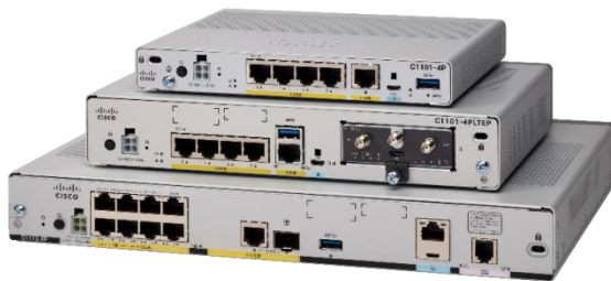
Figure 2. Cisco 1100-8P ISR with LTE Advanced, Back and Front View