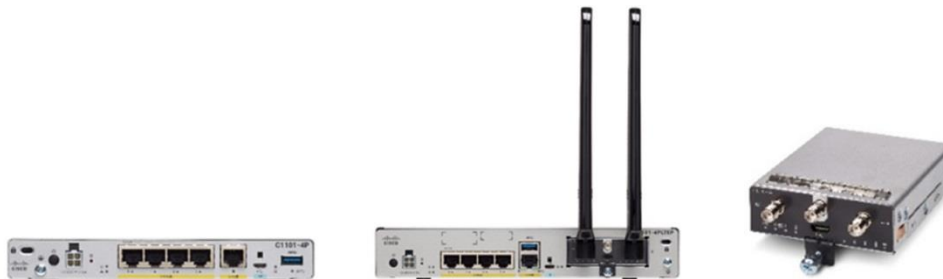
Figure 5. Cisco 1109-2PLTE with fixed CAT4 LTE (Available late October, 2018)