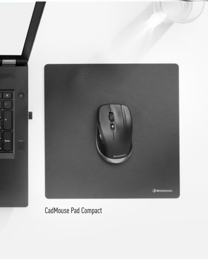
CadMouse Pad Compact

Dedicated Middle Mouse Button – the days of clicking the mouse wheel are over thanks to the CadMouse's intelligent ergonomic design.