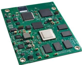
Figure 1. Cisco ESR6300 NCP model (no cooling plate)

Cisco has an ecosystem of partners and systems integrators that embed Cisco ESR6300s into industry-standard, commercially available enclosures as well as custom enclosures tailored to the unique environments in which these routers are deployed. Figures 1 and 2 show the Cisco ESR6300 NCP (no cooling plate) and ESR6300 CON (conduction-cooled) models, respectively.