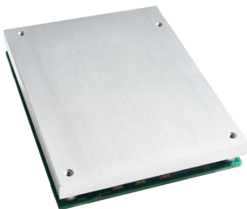
Figure 2. Cisco ESR6300 CON model (with cooling plate)