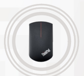
ThinkPad Precision Wireless Mouse