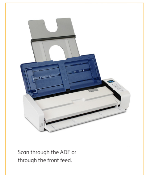
Scan through the ADF or through the front feed.

The Xerox® Duplex Portable Scanner is a perfect scanning solution for companies of any size, in any industry, from legal and healthcare, to insurance to finance, and everything in-between. It is an all-around solution for organizing and controlling business-critical data.