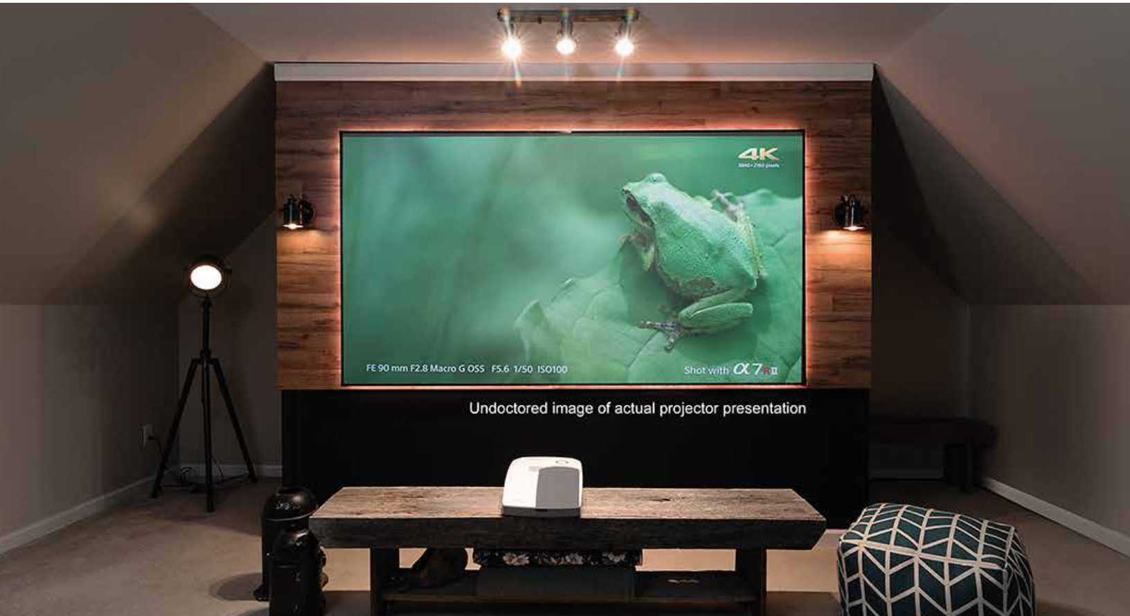
Undoctored image of actual projector presentation

The Aeon CLR® is an EDGE FREE CLR® fixed frame screen that uses Elite's innovative StarBright CLR® (Ceiling Light Rejecting®) material.