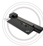
ThinkPad® Workstation Dock