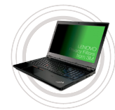
Lenovo™ Privacy Filters from 3M™