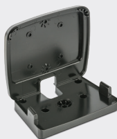
▪ 90ACC0299 Table/Wall Mount