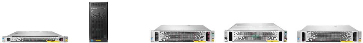
HPE StoreEasy 1450 Storage