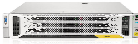
HPE StoreEasy 3850 Gateway