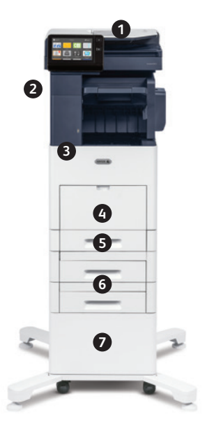
Xerox® VersaLink® B615 Multifunction Printer Print. Copy. Scan. Fax. Email.