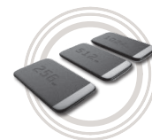
Lenovo USB-C SSD