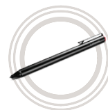
Lenovo Active Pen 2