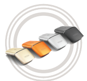
Lenovo Yoga™ Mouse