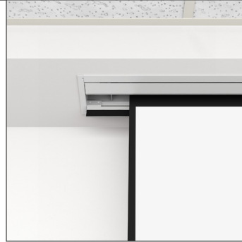
In Ceiling (Open)