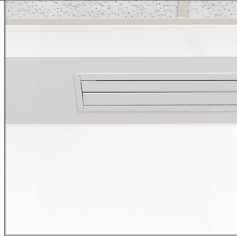
In Ceiling (Closed)