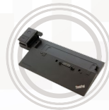
ThinkPad Pro Dock