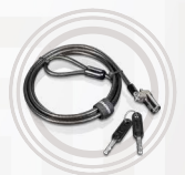
Microsaver DS Cable Lock