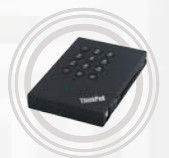
ThinkPad USB 3.0 Secure Hard Drive