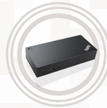
ThinkPad ThunderBolt Dock