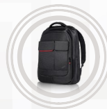
ThinkPad Professional Backpack