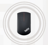
ThinkPad Precision Wireless Mouse