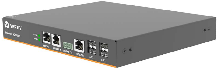
Avocent® ACS 800 Serial Console for the Edge

The Avocent ACS 800 serial console system takes our renowned enterprise class technologies utilized in data centers around the world and packages the key features into an exciting compact and cost effective form factor. Providing serial access, environmental monitoring, IoT integration and remote networking capability to the Edge oriented market sectors of financial institutions, retail chains, education and others.